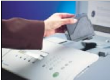
The Hewlett-Packard "Click n' Snap™" ink cartridge makes re-inking a snap, with no mess.