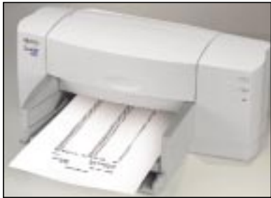
An optional printer can be added to print 8.5"x11" postage accounting reports.