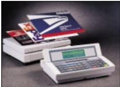
Optional 5, 10, 30 and 70 pound scales interface with the IJ75 for weighing items and automatically setting the correct postage.